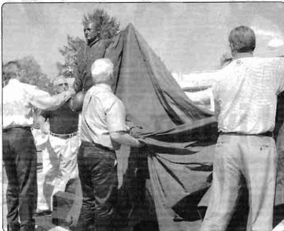
The life-size bronze statue of Coach Petercuskie is unveiled.